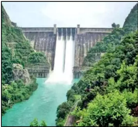
Bhakra Nangal Dam