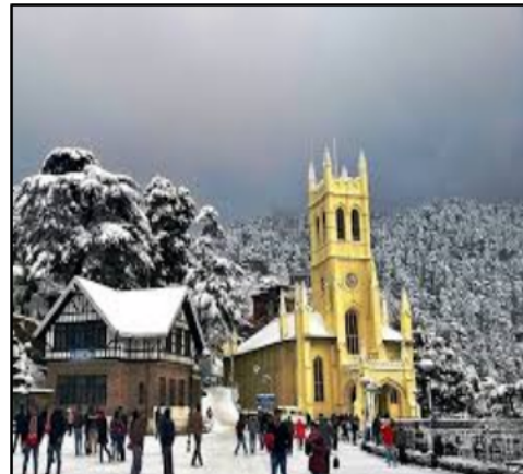
Queen of Hills